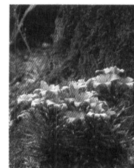
Cover Cover photo by Oscar C. Williams

Copyright © 1998 Soil and Water Conservation Society. All rights reserved. Journal of Soil and Water Conservation 53(2):90-156 www.swcs.org