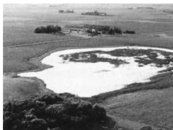
On the cover Restored wetland under Conservation Reserve Program (CRP) in Kossuth County, Iowa.